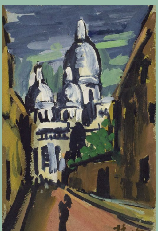
Liu Kang. View of Sacré-Cœur. Gouache on paper, 25 × 16.5 cm.