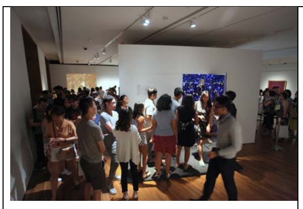
Visitors queuing to get into one of Kusama's signature infinity mirror rooms, Infinity Mirrored Room – Gleaming Lights of the Souls (2008) in Gallery B