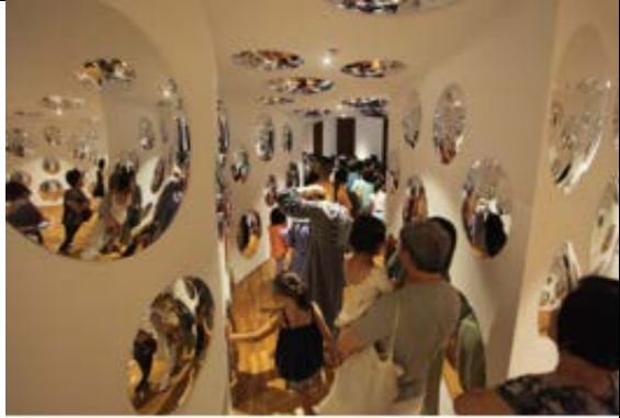
Here, the installation Invisible Life (2017) marks the start of Gallery B, which considers Kusama's engagement with the human body through installation, performance, sculpture and painting