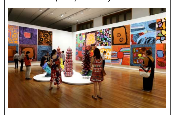
Visitors in Gallery C, where they are surrounded by works from Kusama's latest series 'My Eternal Soul', of which some of the pieces were displayed for the first time