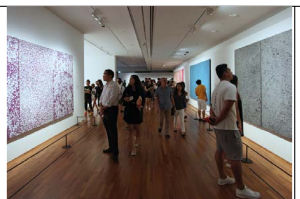
Visitors in Gallery A, which looks at Kusama's use of dots, nets and pumpkins through painting, sculpture and installation from the 1950s to the present

The intimate and immersive exhibition, which ran from 9 June to 3 September, intrigued and thrilled visitors with Kusama's signature pieces, such as her pumpkin installations, infinity mirror rooms and her most recent works – a cluster of soft sculptures and several paintings from her 'My Eternal Soul' series (2009–ongoing), some of which were on display for the first time.