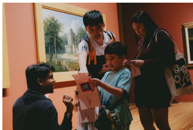
A family exploring a programme, 'How to Art With Friends', in the UOB Southeast Asia Gallery

The UOB Southeast Asia Gallery has fostered a profound connection with diverse audiences including regular in-Gallery sessions, where curators and artists engage in intimate dialogues about artworks or its Resonates with Residency where local artists respond to the Gallery's regional collection. The UOB Southeast Asia Gallery also hosts students of all ages to kindle respect cultural awareness and an appreciation of the region's rich artistic history.