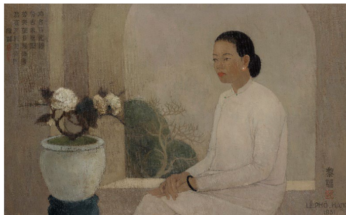
Lê Phổ. Jeune fille en blanc (Young Girl in White). 1931. Oil on canvas, 81 × 130 cm. Collection of National Gallery Singapore.

Situated within the historic former Supreme Court building, the UOB Southeast Asia Gallery offers an insightful journey through Southeast Asia's artistic heritage, showcasing a carefully curated ensemble of approximately 300 artworks across 15 galleries. Continuously evolving, the Gallery regularly introduces new acquisitions and engaging programming to captivate visitors, with approximately 20% of the artworks being refreshed annually. The works from the National Collection featured in the UOB Southeast Asia Gallery have also been loaned to