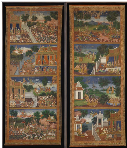
Artist unknown. Pair of Preah Bot paintings depicting Jatayu and the Vanaras . c.1900. Tempera on canvas, 199.5 x 81.5 cm (left) 202 x 79.5cm (right). Collection of National Gallery Singapore.

With the generous support from UOB towards new acquisitions moving forward, the Gallery hopes to further enhance its holding of such exceptionally significant works from Southeast Asia in the National Collection.