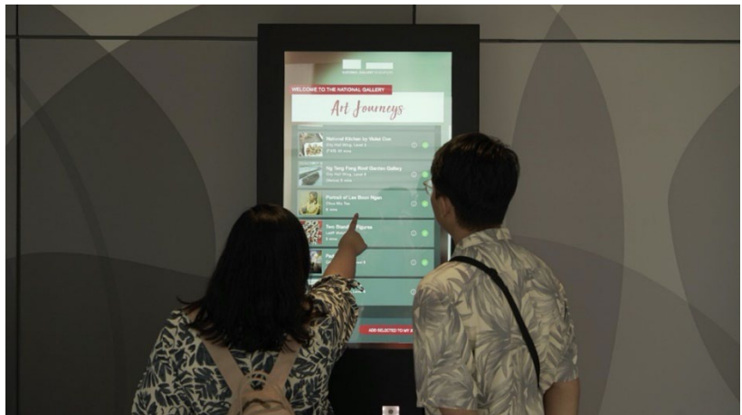
Self -Service Digital Kiosks

The Art Journey function will also be available via 19 new Self-Service Digital Kiosks located around the Gallery. For visitors that prefer to drop by on a spontaneous visit, the kiosk allows them to explore and select a curated Art Journey or personalise their own, purchase, and print their Gallery Passes at one convenient touchpoint.