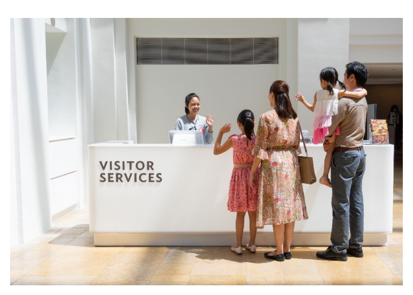
Revamped Visitor Services Counters

For visitors who prefer a human touch, they may continue to seek assistance from the Gallery's roving concierges and Visitor Services Counters.