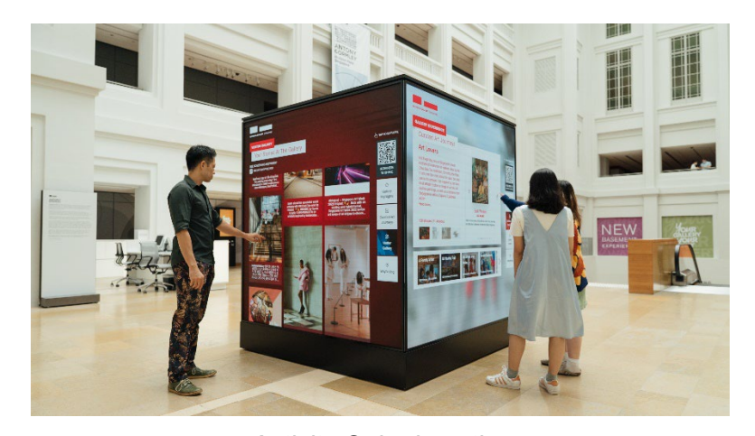
Activity Cube in action

Upon entering the Gallery via the Coleman Street entrance, visitors are greeted by Arrival Landmark pillars which showcase key exhibitions and festivals to inspire visitors to include these programmes in their Art Journeys.