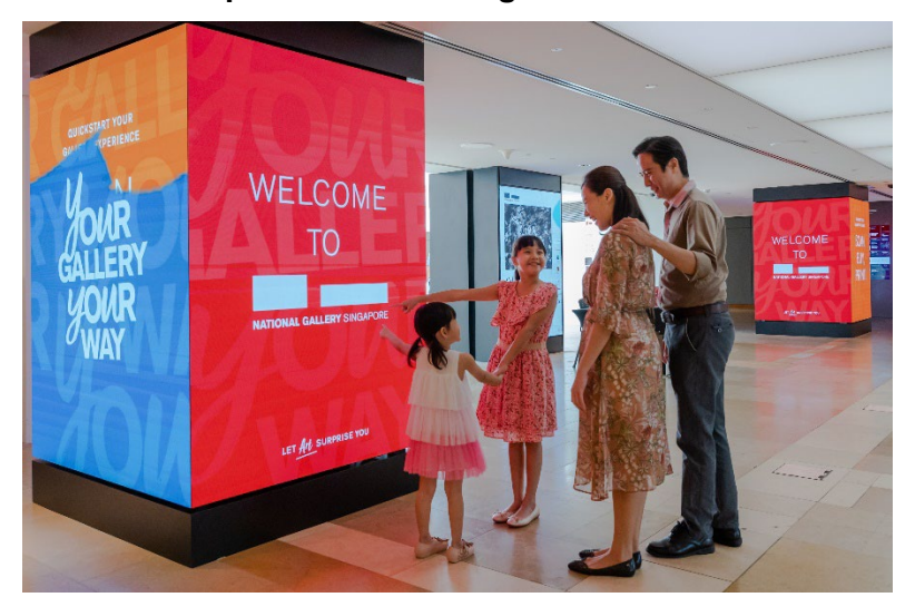
Arrival Landmarks near the Coleman Street entrance

Upon entering the Gallery via the Coleman Street entrance, visitors are greeted by Arrival Landmark pillars which showcase key exhibitions and festivals to inspire visitors to include these programmes in their Art Journeys.