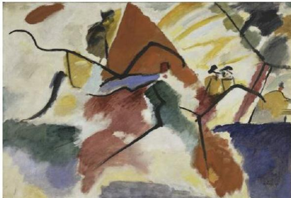
Vassily Kandinsky Impression V (Park)

Collection of University of Santo Tomas Museum, Manila