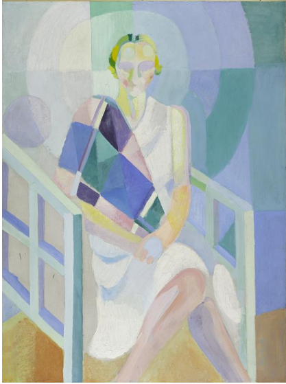
Robert Delaunay Portrait of Madam Heim

c. 1926 – 1927 Oil on canvas 130 x 97 cm