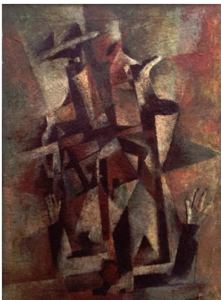
Sompot Upa-in Politician