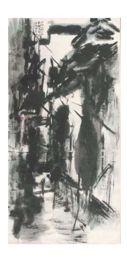
After the Rain 雨后 2004 Ink and colour on paper 244 x 120cm Collection of Singapore Art Museum