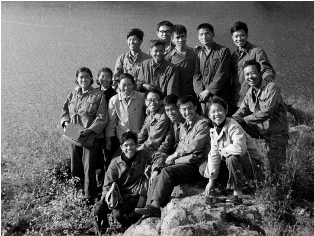
Wu (back row, second from left) with students from the 1977 class of Central Academy of Art and Design's Department of Graphic Design, on an outdoor drawing trip to Shanhai Pass, October 1978.

Regarded as one of the most significant contemporary Chinese artists of the 20th century, Wu Guanzhong is renowned for his distinctive style that integrates Western and Chinese art traditions. In addition to his artistic practice, Wu is also acclaimed as an art educator, having selflessly shared his artistic philosophies and experiences with students at leading educational institutions in China over a teaching career that spanned more than 40 years.