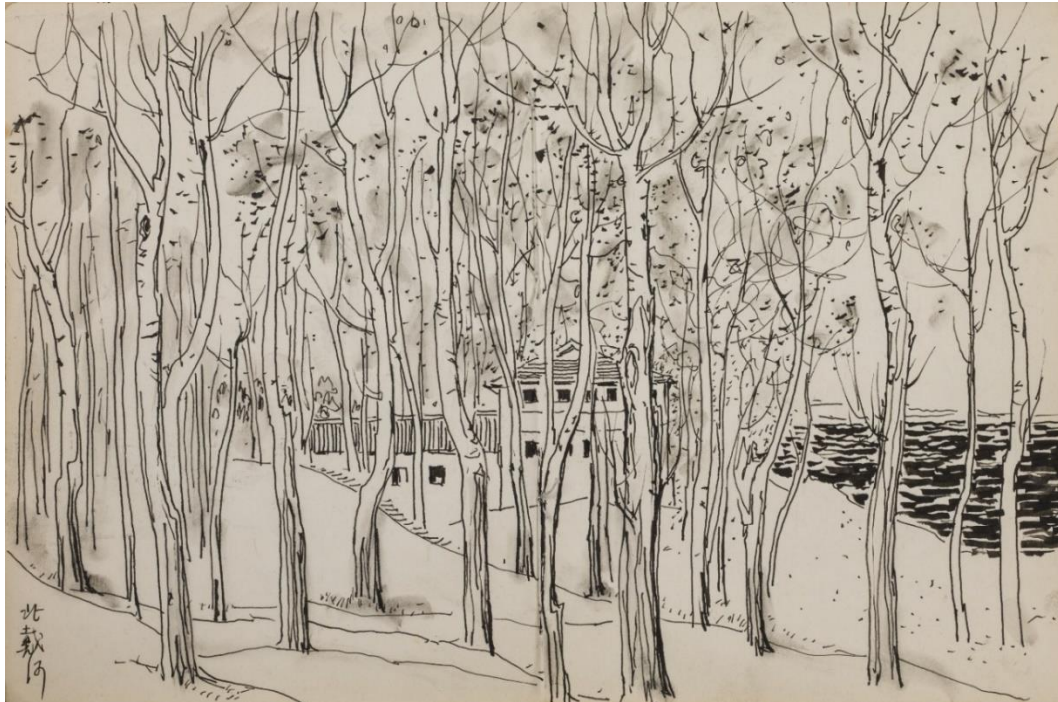
Notes from outdoor teaching trips to the Great Wall and Qinhuangdao. 26 drawings, 1978. Carbonic ink and pen on paper. Collection of the Tsinghua University Art Museum.

Pen & Palette , following thematic explorations on the artist's life and practice in earlier exhibitions.