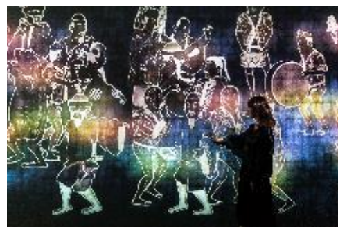
[From left to right] One or Several Tigers, and Walk, Walk, Walk: Search, Deviate, Reunite