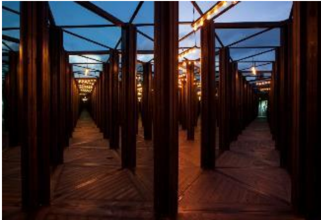
House of Mirrors

in a house-sized kaleidoscope after dark.