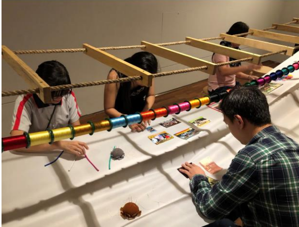
A Stitch in Time

As part of the Light to Night Festival , National Gallery Singapore has also commissioned five artists who are richly informed by their own history and experience of the region to create indoor participatory art works, of which two will be unveiled at the Festival. A Stitch in Time by Filipino artist David Medalla is an expansive sculptural work that was inspired by his chance reunion with a handkerchief that he had gifted to an ex-