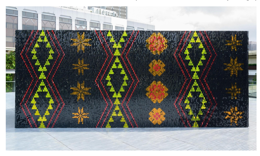
Installation view of GLISTEN wall with Tāniko and Songket patterns, National Gallery Singapore, 2024.