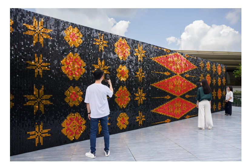
Installation view, GLISTEN by Lisa Reihana, National Gallery Singapore, 2024.

multi-sensory encounter with the artwork. Visitors of all ages are welcome to experience the celebratory and joyful nature of the artwork, inspiring a deeper appreciation of the respective cultures, while prompting them to explore the connections between Southeast Asia and Aotearoa New Zealand which have existed since pre-colonial times.