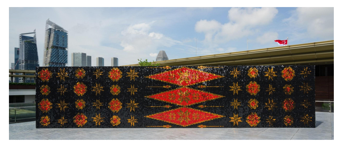
Installation view of GLISTEN wall with Songket patterns, National Gallery Singapore, 2024.