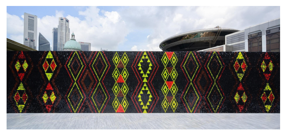
Installation view of GLISTEN wall with Tāniko patterns, National Gallery Singapore, 2024.