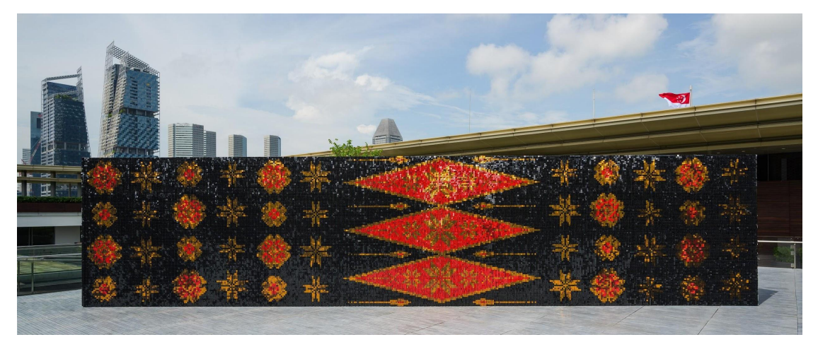
Installation view of GLISTEN wall with Songket patterns, National Gallery Singapore, 2024.

Songket is a textile handwoven in silk or cotton and patterned with gold or silver threads, and Lisa Reihana looked into Malaysian Songket weave patterns for GLISTEN , referencing materials such as Malaysian artist Grace Selvanayagam's book, Songket: Malaysia's Woven Treasure . Songket is traditionally worn during ceremonial occasions including weddings and religious ceremonies where the colour and grandeur of Songket adds to the occasion, and in the early centuries, Songket was only worn by Malay royalty. The motifs featured in the patterns include the Pucuk Rebung Gigi Yu which fuses the Rebung (bamboo shoot) and shark motifs, the Teratai (lotus) which is associated with Malay culture and religions, and the mangosteen which symbolises the reflection of one's feelings or one's inner self as related to human spiritual state (Dawa, 1997).