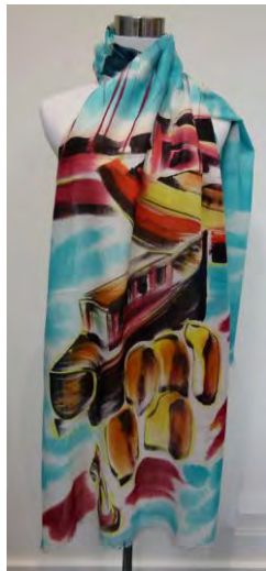
Liu Kang's Boats Shawl