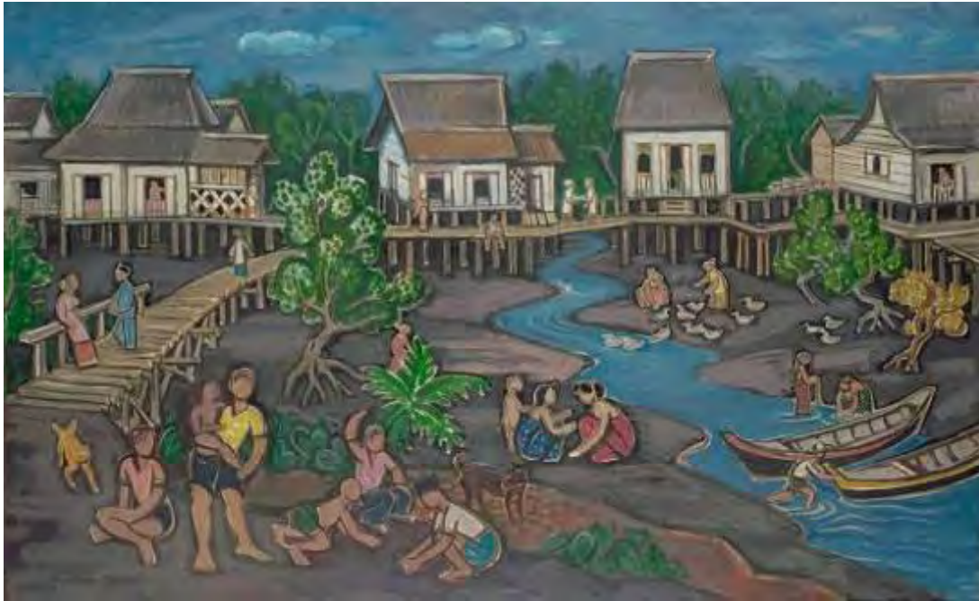
Liu Kang, Life by the River , 1975, oil on canvas, 126 x 203 cm, collection of National Heritage Board