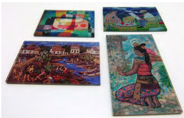
Liu Kang's artworks Acrylic Fridge Magnet