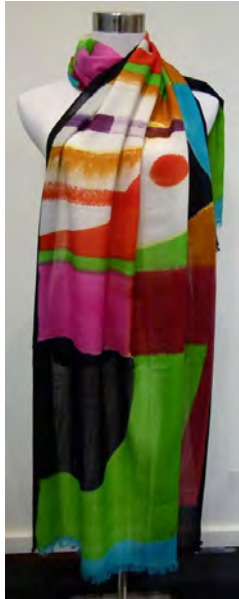
Liu Kang's Abstract Fish Shawl