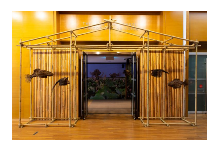
Installation view of Calling for Rain by Khvay Samnang for Gallery Children's Biennale 2021