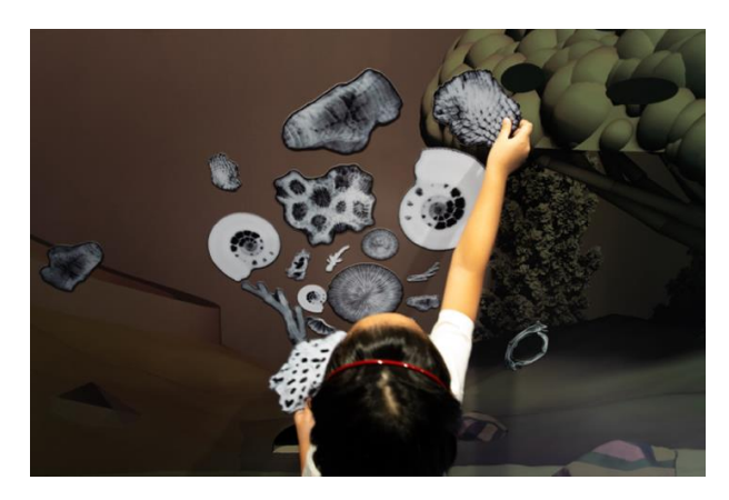
Installation view of Illuminated by Nona Garcia for Gallery Children's Biennale 2021

An extension of the online work, Baguio-based artist, Nona Garcia's Illuminated features four life-sized landscape backgrounds which transport children into an other-worldly space. With an array of intriguing x-rayed bones, shells and fossils as magnets, children will be empowered to creatively express themselves and place these magnets anywhere on the backgrounds, creating their own sceneries of imagination and reflecting their unique perspectives. They may also view and add on to the creations by other children, co-creating artworks with them in real time, thus reflecting a diverse collection of stories as told by the artworks on the walls.