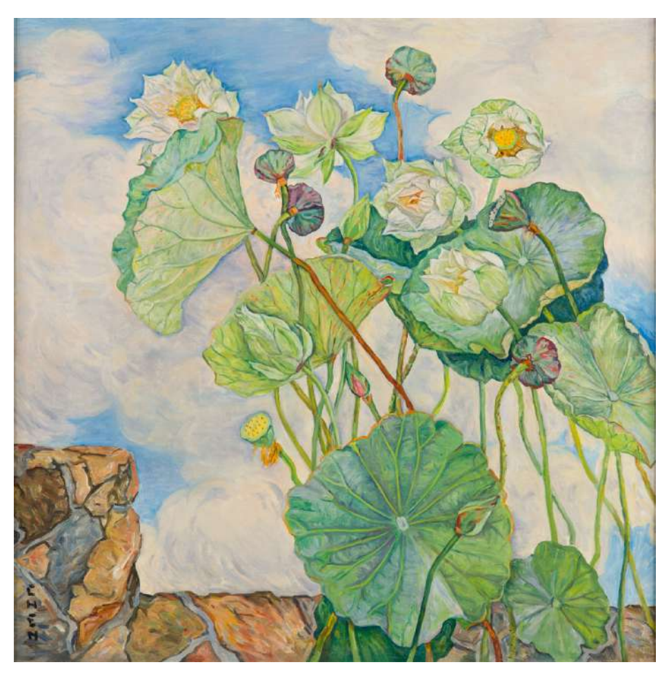
Lotus in a Breeze Georgette Chen c. 1970 Oil on canvas Gift of Lee Foundation Collection of National Gallery Singapore