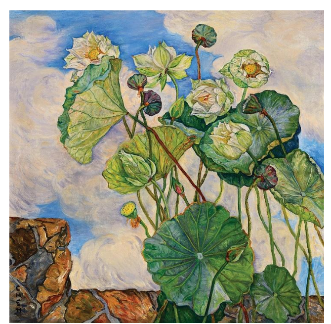
Georgette Chen. Lotus in a Breeze . c. 1970. Oil on canvas, 81 x 81 cm. Gift of Lee Foundation. Collection of National Gallery Singapore.

Georgette Chen, one of Singapore's pioneer artists, loved painting lotuses.