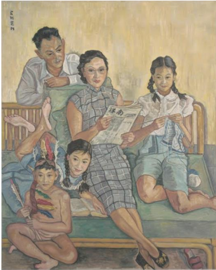
Georgette Chen. Family Portrait . c. 1954. Oil on canvas, 161.5 x 130.2 cm. Gift of the artist's estate. Collection of National Gallery Singapore