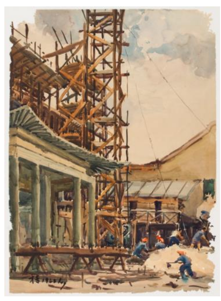
Loy Chye Chuan. Construction of Chinese Chamber of Commerce. 1963. Watercolour on paper, 50 x 37 cm. Collection of National Gallery Singapore.

Loy Chye Chuan captures the architecture of the Chinese Chamber of Commerce while it was under construction. The towering structure stands in stark contrast to the small figures of Samsui women labouring with their backs bent.