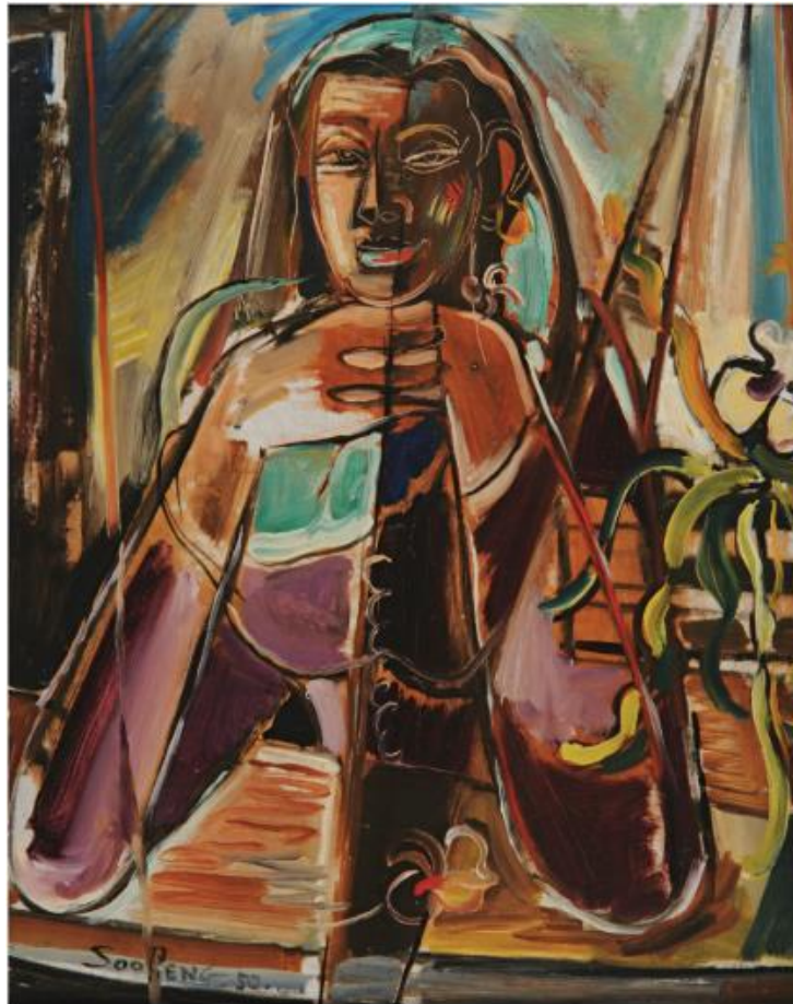
Cheong Soo Pieng. Malay Woman . 1950. Oil on board, 49.2 x 39 cm. Collection of the National Gallery Singapore.

Inspired by the colour and light of Southeast Asia, Cheong Soo Pieng used a predominantly warm colour scheme in this painting Malay Woman . He drew strong, straight lines across the woman's arms, face, and upper body, which creates interesting perspectives of this woman even as she appears to be sitting still.