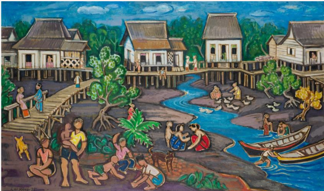
Liu Kang. Life by the River . 1975. Oil on canvas, 126 x 203 cm. Gift of the artist. Collection of National Gallery Singapore.

Let's take a closer look at how artist Liu Kang depicted daily life in the 1970s. The painting below shows people going about their everyday activities in a kampong, like near present-day Pasir Panjang.