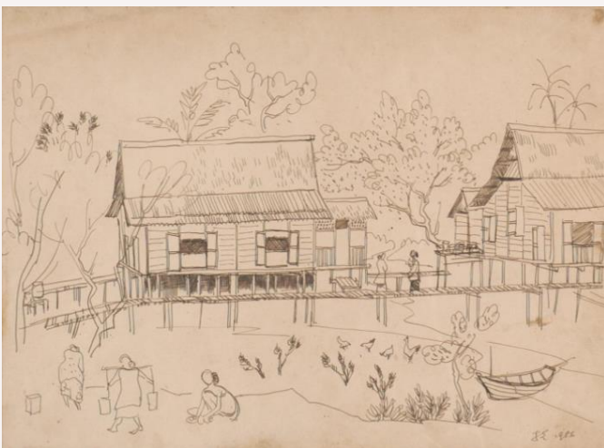
Liu Kang. Life by the River (sketch). 1956. Drawing, 28.5 x 38 cm. Gift of the artist's family. Collection of National Gallery Singapore.

Liu Kang observed and sketched everyday scenes as part of his artistic process.