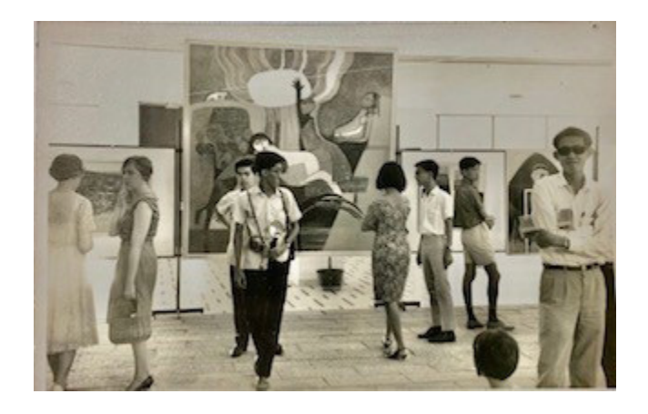
Children of the Sun in Khoo's exhibition at Singapore Conference Hall, 1966

During watercolour and oil classes, we had still-life scenes and live models. For still-life painting, I was always