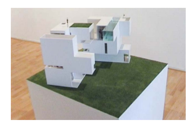
Stud House (2003), Michael Lee

I was privileged to go to school in a school bus, which allowed me to stare out at construction sites quite a lot. I find sites under construction fascinating because there is always a lot of building activity. The thing that is being built is ever-growing. Everything seems very open, transparent to view. But once a building is completed, it becomes a little selfish, like a lot of things are covered up and private. I think this fascination with the process of making, rather than the product, exists in my work in the background. While a lot of my work comprises finished projects, more and more, this fascination with the construction process comes into the picture. My relationship with architecture since my school bus days has always been as an onlooker—a pedestrian—rather than as one trained in it. My own training was in communications, with a major in video production.