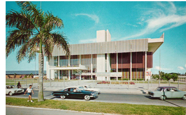
Singapore Conference Hall, c. 1970.