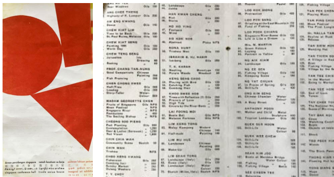
(Left) Cover of brochure of first art exhibition at the Singapore Conference Hall, 15 to 25 Oct 1965; (Right) List of artists and works

This is the brochure for the first art exhibition at the Singapore Conference Hall, which was also an exhibition held for the Singapore Arts Society. The brochure was designed by Choy Weng Yang—you can see his affinity with the Bauhaus. He