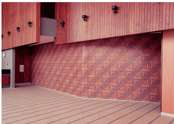
Mosaic walls of the Singapore Conference Hall, inspired by Terengganu mat designs

You will notice a piece of public sculpture, which was never finished. So, when I made the model, I recreated the concept for this sculpture—a public sculpture on the floor, which can be changed in its configuration. It's of course a modulation on the pyramid. This gives you an idea of the background in visual design that I had in MIT, under the great teacher called György Kepes, who was really part of the Bauhaus, because he was an associate of László Moholy-Nagy. So, the discipline of form was what we imbibed, and I believe the validity still today, against the decadence of the very wanton type of design going on.