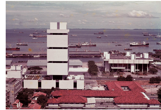
The now demolished MSA building (left) and Singapore Conference Hall (right)

We tried to introduce public art to the building in the form of a sculpture by Kim Lim, who was probably Singapore's most famous sculptor. She was married to the British artist William Turnbull; we were great friends. Her brother was actually my classmate in Penang and in London. So, I persuaded her, or rather her parents, to lend her piece called Day .