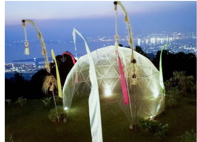
Geodesic dome on Penang Hill

fact, for the many Buckians here: you should celebrate him because he was present at many events: he had a very genuine connection with Southeast Asia—with Penang, Bali, Singapore. As a tribute, I made a dome for him. This is what it looked like at night, on Penang Hill. I made another 40-foot, six frequency geodesic dome for Bucky in my botanic garden in Penang. And as his virtual memorial, we were commissioned to do another dome in the Suan Luang Rama IX Park in Bangkok: a 90-foot geodesic in honour of Bucky, a geodesic dome which the US Chamber of Commerce donated for the King’s Park in 1988.