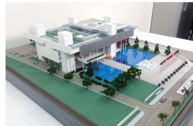
Model of the Singapore Conference Hall commissioned by M+