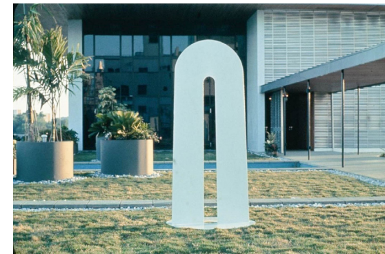
Day (1966) by Kim Lim on the podium roof of the MSA building

We tried to introduce public art to the building in the form of a sculpture by Kim Lim, who was probably Singapore's most famous sculptor. She was married to the British artist William Turnbull; we were great friends. Her brother was actually my classmate in Penang and in London. So, I persuaded her, or rather her parents, to lend her piece called Day .