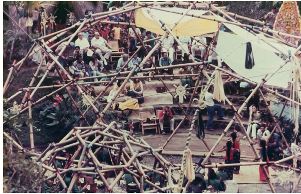
Bamboo tensegrity dome for Buckminster Fuller's birthday in Bali, 1977.

We then—because of my connection with Bucky—we had this great meeting and I did a tensegrity geodesic in bamboo there in the valley, and this was 1977. The great festival for his birthday. He last came to Singapore in 1982 where the School of Architecture students did this pipe geodesic at Starpoint.