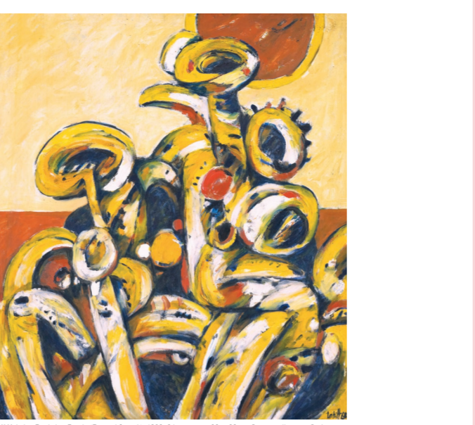
⑥ Tumbuhan Tropika (Tropical Growth) LATIFF MOHIDIN

The artworks in this section are arranged on freestanding structures resembling a constellation of ideas, dreams and aspirations.