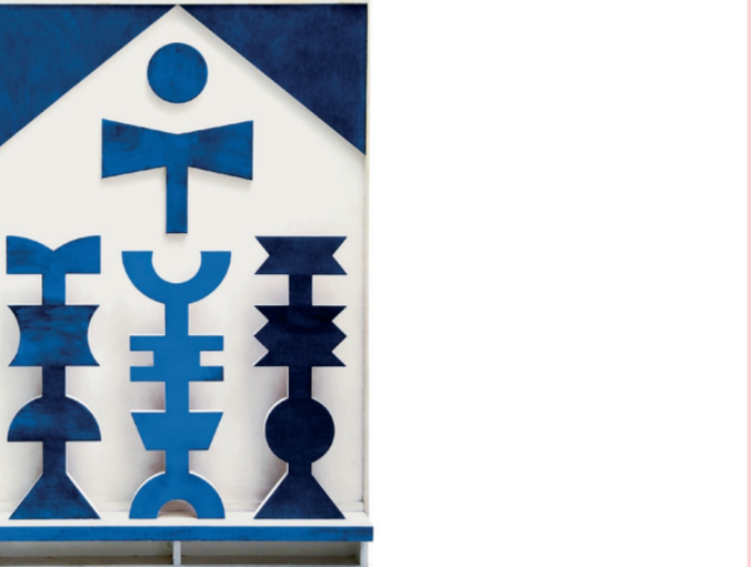
⑦ Objeto Emblematico 1 (Emblematic Object 1) RUBEM VALENTIM