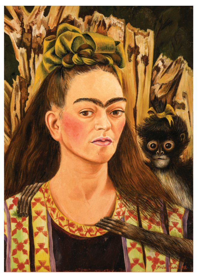
④ Self-Portrait with Monkey FRIDA KAHLO

Their response was a powerful one—they turned to the self-portrait as a means to depict the shared heritage of mankind. This new world held the promise of a future that was democratic and prosperous, and where everyone was equal. Racing alongside this was a growing eagerness to pioneer and innovate with techniques like weaving, carving and batik. These methods became their tools in their quest to establish a shared earth for mankind.